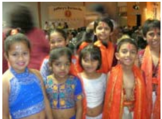
Colourful cultural performances by groups of children were part of the festive events at Shakti's 10th anniversary celebrations.

"The support that organisations like Shakti give is incredibly important," Helen Clark said. "Congratulations on a successful first ten years and I'm sure there will be many, many more."