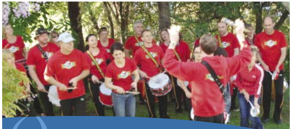
The AKSamba Band in full swing