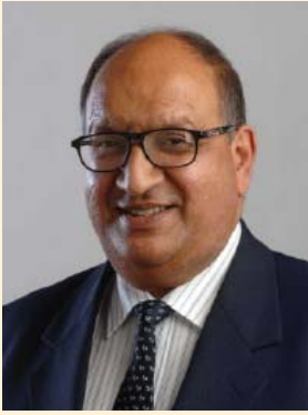
Hon Anand Satyanand, PCNZM, QSO Governor-General

Greetings, Kia Ora, Kia Orana, Fakalofa Lahi Atu, Taloha Ni. As Governor-General, it has been my pleasure to support Home and Family Counselling as Patron in the past year. The organisation plays a significant role in helping many New Zealand families cope with everyday challenges. Dealing with clients from all cultures requires a great degree of sensitivity and it is indeed encouraging to see Home and Family Counselling responding to a varied need.