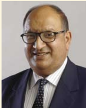
Hon Sir Anand Satyanand, GNZM, QSO Governor-General

It is with pleasure that I provide this message for Home and Family Counselling's Annual Report.