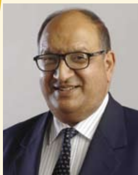
Hon Sir Anand Satyanand, GNZM, QSO Governor-General

As Governor-General, it is with pleasure that I provide this message for Home and Family Counselling's Annual Report.